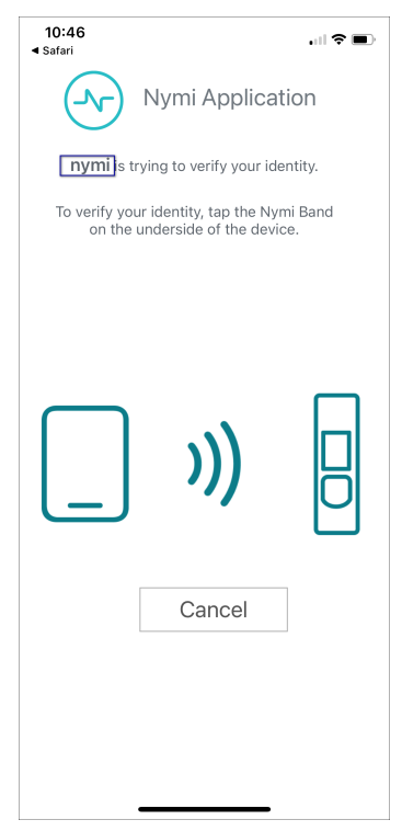
Figure 3: Integrator Name

4. Implement or use an existing method in your web application that assigns a unique and persistent identifier to each iOS device.