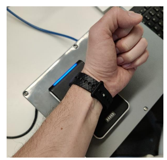
Figure 6 – User tapping band on Signo 40 reader.

The user is then instructed to tap their band on the door reader. In this case, an HID Signo 40 reader has been used in the demo PACs system.