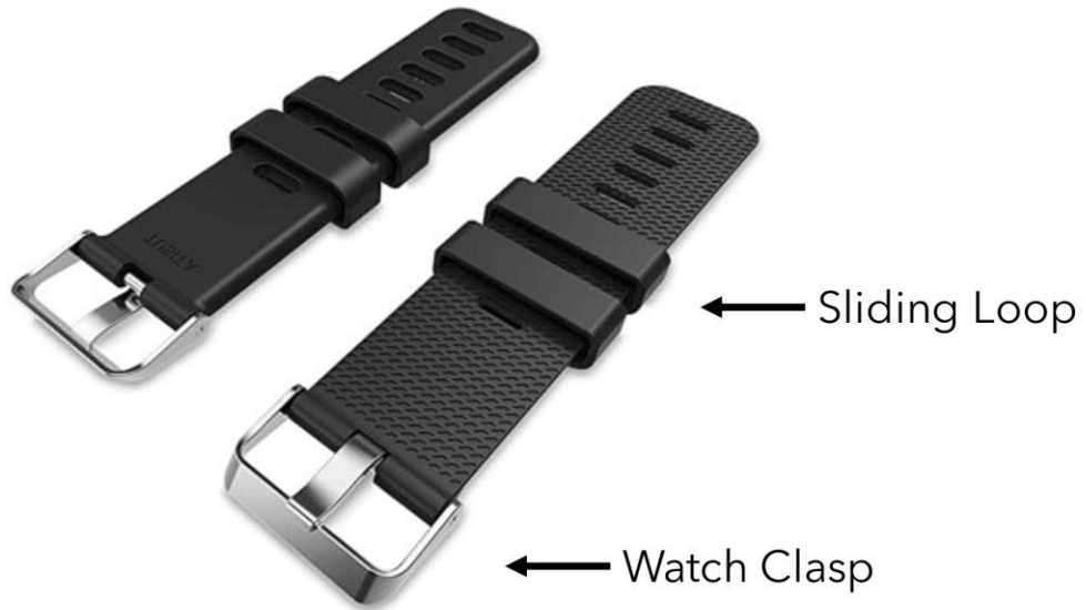
Figure 1 - TUSITA Strap Extenders